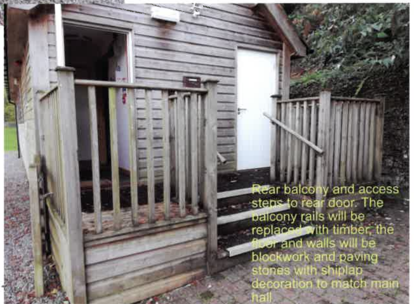
Rear balcony and access steps to rear door. The balcony rails will be replaced with timber, the floor and walls will be blockwork and paving stones with shiplap decoration to match main hall.