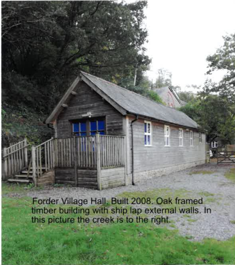
Forder Village Hall. Built 2008. Oak framed timber building with ship lap external walls. In this picture the creek is to the right.