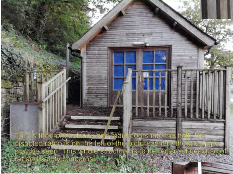
This is the front balcony and main doors into the hall. The disabled ramp is on the left of the picture where the grey paper may be seen. This whole structure is to be removed because of rot and safety concerns.